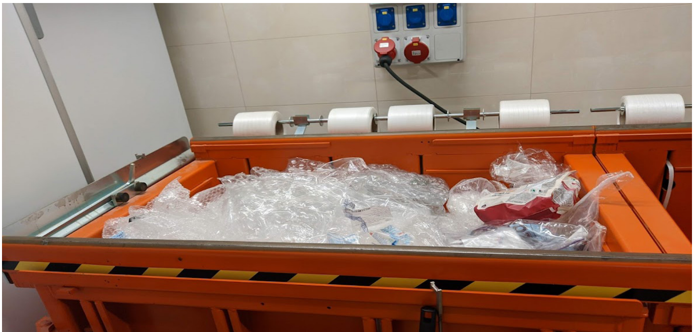
Plastic foil compacted in one of the four chambers.