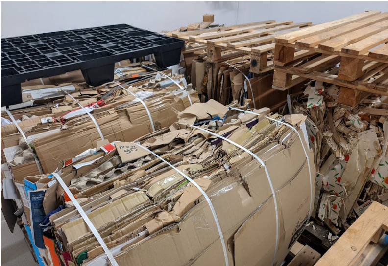
Compact cardboard bales line up waiting for the collector.